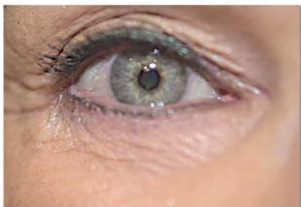
Right Eye: Not treated