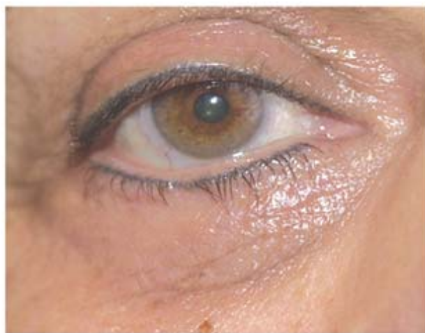
After 45 days of treatment with SkinRenu Intensive Serum W and Anti-Wrinkle Fineline Reducing Formula